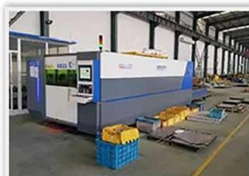
1. Laser cutting

Professional production, quality assurance